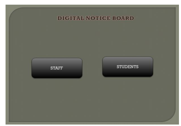
Figure 2: Main Page of app.

Function of app is display the notice any time not only in college hours.